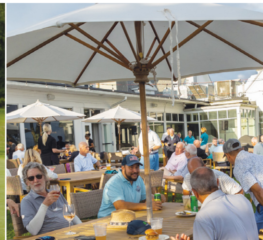
Above, left to right: Runners and walkers at the starting line for the Walk/Run for Hospice in North Attleboro, MA. East Coast Distributors' foursome sinking a putt at the HopeHealth Invitational. Relaxing after a great day of golf at the HopeHealth Invitational.